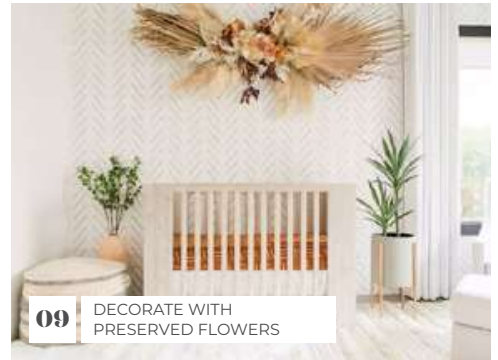
09 DECORATE WITH PRESERVED FLOWERS

Step 06 Mix together mayonnaise, honey, sweet chili sauce, and gochujang in a large serving bowl until combined. Toss fried chicken with sauce to coat.