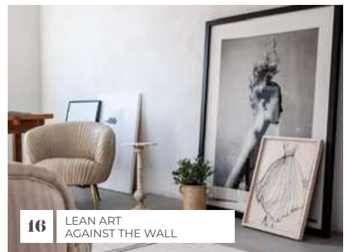
16 LEAN ART AGAINST THE WALL