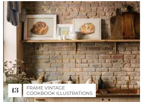
13 FRAME VINTAGE COOKBOOK ILLUSTRATIONS